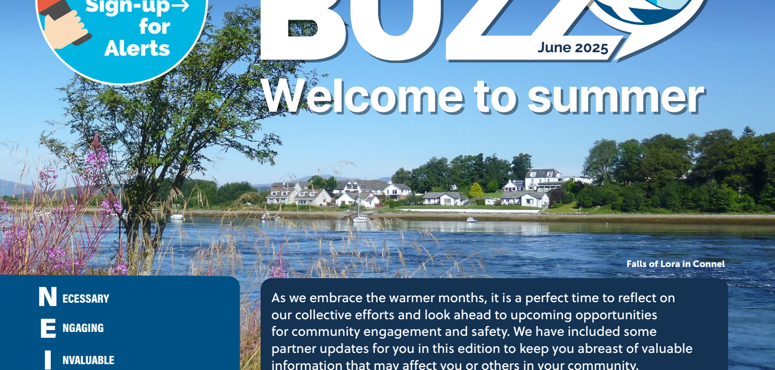
Falls of Lora in Connel

N ECESSARY E NGAGING I NVALUABLE G ETTING TO KNOW YOUR NEIGHBOURS H ELPFUL B ESPOKE TO LOCAL NEEDS O N THE RISE! U NITY R ESILIENT COMMUNITIES L OOKING OUT FOR EACH OTHER I NCLUSIVE N OT TO BE UNDER ESTIMATED E NHANCING WELLBEING AND ENCOURAGING COMMUNITY SPIRIT S USTAINABLE S UPPORTIVE